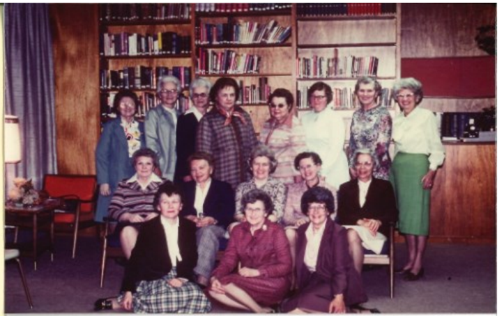
Leadership Training Class 1981