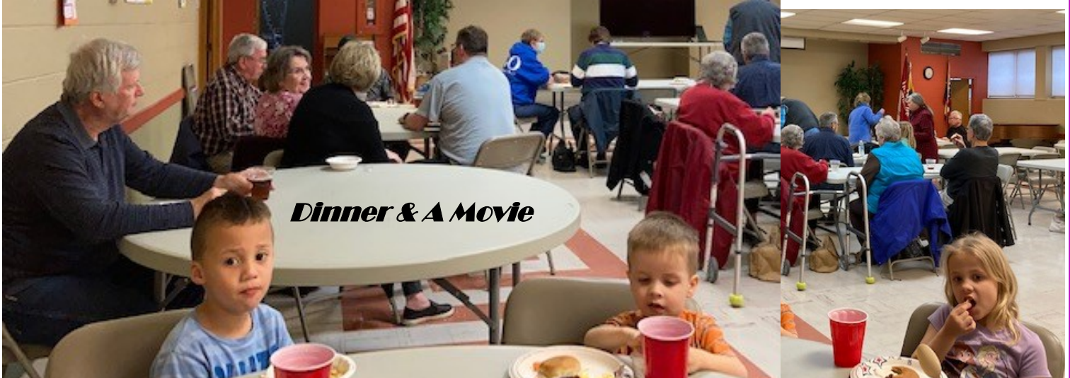
Dinner & A Movie

Little Free Library – You might have noticed something new went up on the side of the church by the food pantry. This is a little library, and it was put in by the Carnegie Library and Altrusa. The idea is that we put books into it that we don't want anymore and take books out of it that we would like to read. Give a book, take a book. Look through your home libraries and consider adding books you have finished reading but are still in good shape. Books of all kinds and for all ages of people are needed.