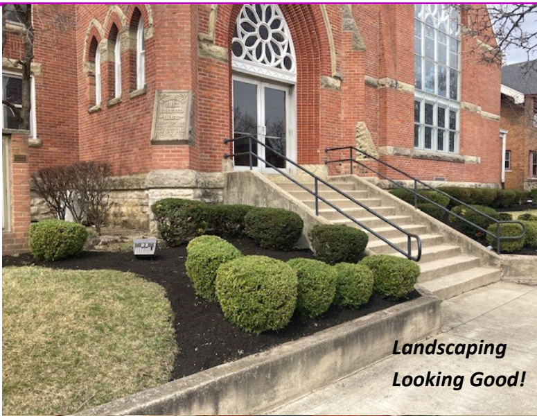
Landscaping Looking Good!